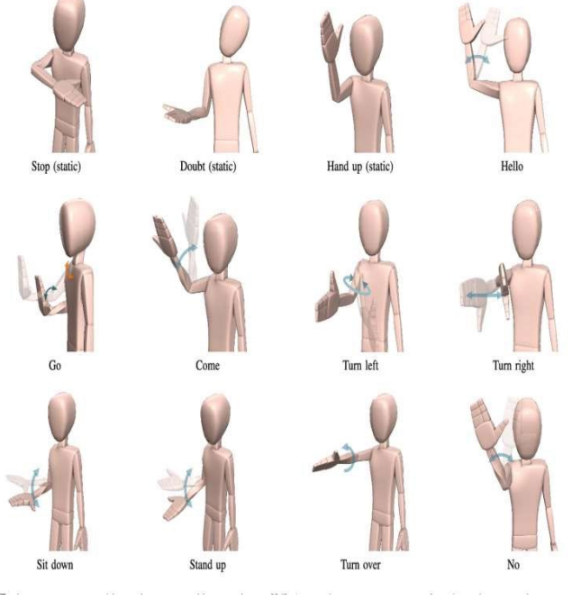
Fig. 1.2. 3D Diagrams

motion analysis, and deep learning techniques, such as recurrent neural networks (RNNs) and spatiotemporal convolutional networks (STCNs), have shown promise in tackling the complexities of continuous and dynamic gesture recognition. By addressing the challenges in this field, researchers aim to enhance the accuracy, versatility, and naturalness of gesture-based interfaces, paving the way for more immersive and intuitive human-computer interactions.